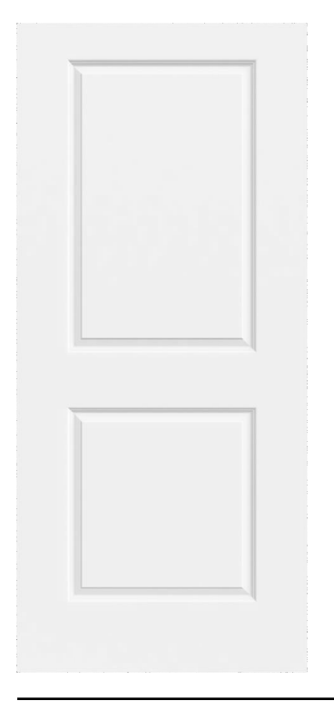
CARRARA SMOOTH UPGRADED INTERIOR DOOR